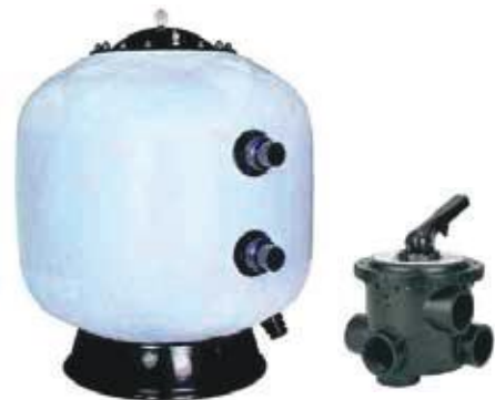
3 inch Multi port-valve

Best choice for efficient water filtration of a public swimming pool or an industrial water treatment system.